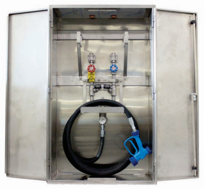
Shown: STVM<sup>®</sup> Washdown Station in Enclosure with 25ft hose assembly and gun (parts sold separately from enclosure)