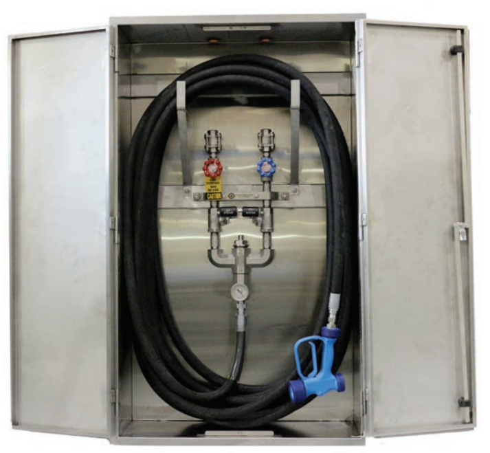
Shown: STVM<sup>®</sup> Washdown Station in Enclosure with 100ft hose assembly and gun (parts sold separately from enclosure)