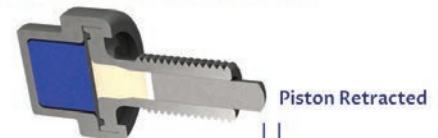
"Cold Position" - Solid State

This thermal phase change in the active region and resulting piston motion occur over a narrow and customizable temperature range – typically within 10-15°F.