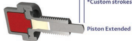
"Hot Position" - Liquid State

Typical Stroke Range 0.1" to 0.5" *Custom strokes available