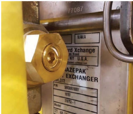
V3 INDICATOR CLOSED POSITION