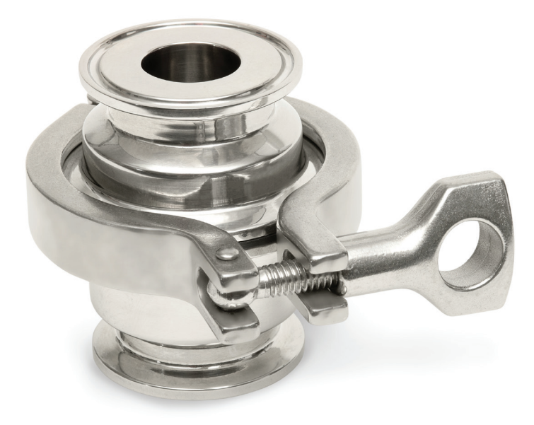
Fig. 1 Vertical option shown