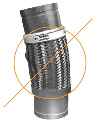
Groove x Groove Improper Installation Parallel