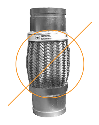
Groove x Groove Improper Installation Compressed