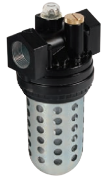
transparent bowl with guard