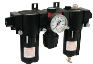
transparent bowl with guard